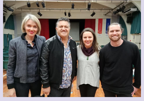
In August we supported The Parenting Place in presenting a session on 'How to talk about porn, sex and technology.' We had over 100 people attend and received great feedback on the value of the event.