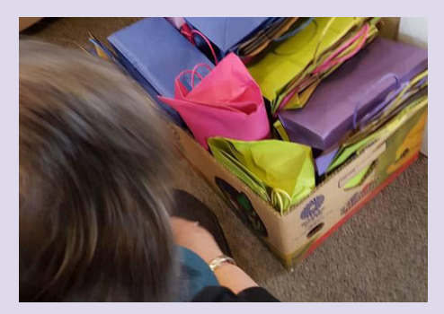
Assembling Christmas gifts in 2017 for the Women at the Prison